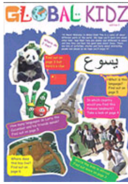
A fun and informative mission magazine for children aged 8-12